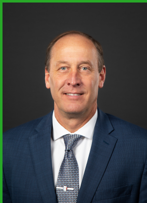
Rep Chad Ingels